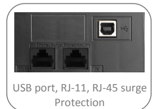
USB port, RJ-11, RJ-45 surge Protection